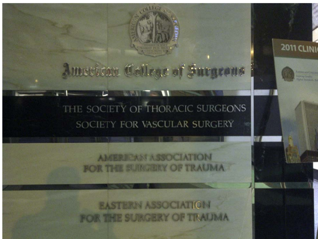
Figure 5. Photo from 2011 ACS Clinical Congress