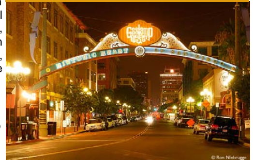
Gas Lamp District