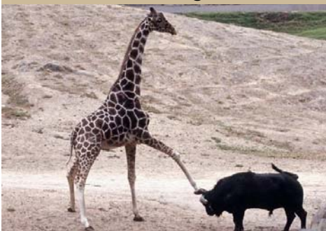
The San Diego Zoo

LEGOLAND - California is a 128-acre park geared specifically towards youngsters ages two through 12. With over 50 family rides, "hands-on" attractions and shows, LEGOLAND California provides education, adventure and fun in this first park of its kind in the United States.